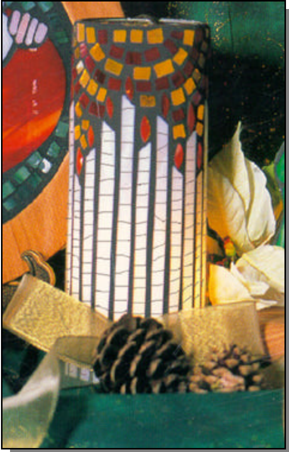
Create this colourful Christmas candle holder from an old coffee jar, simply and easily with Glass Mosaics.